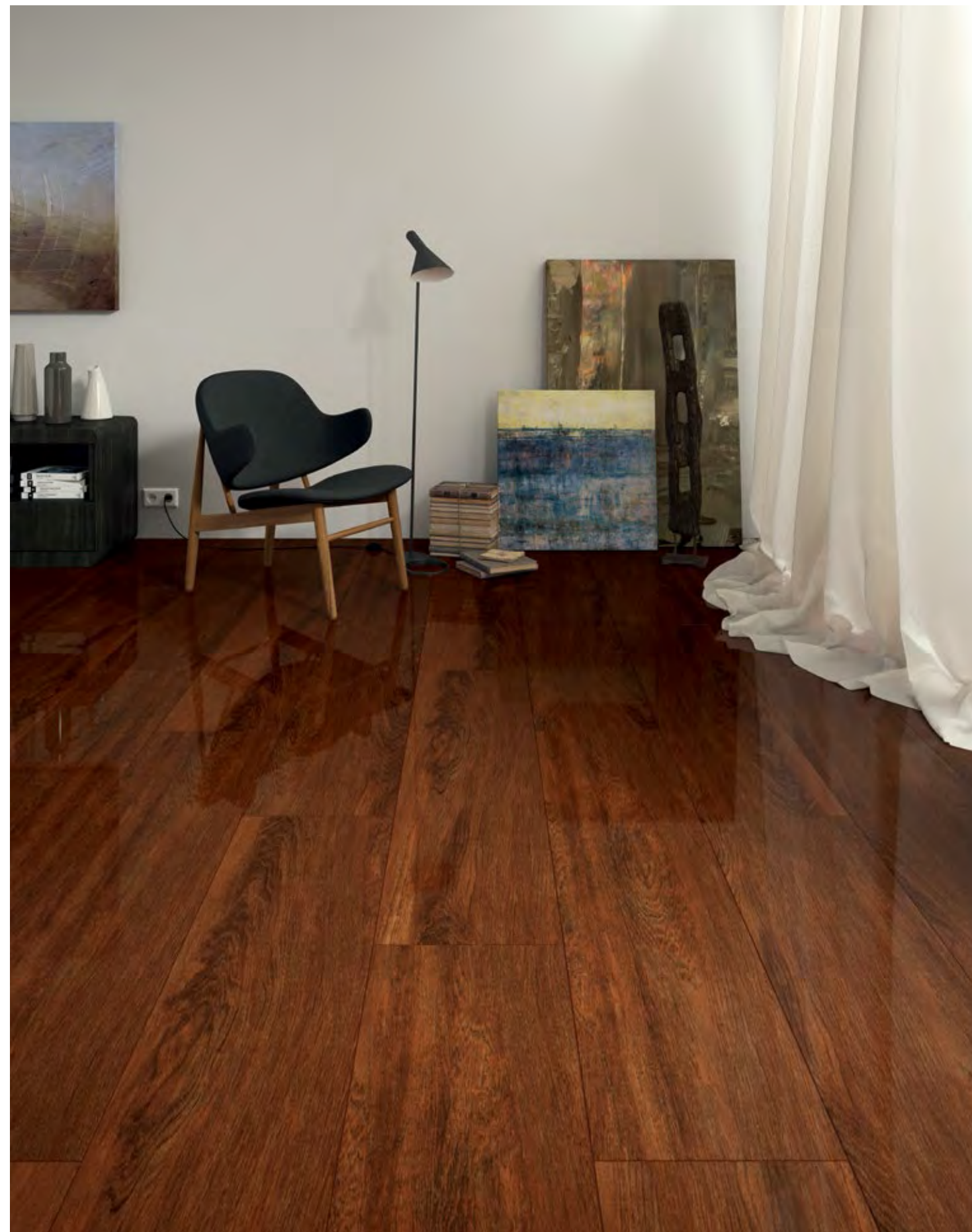
Pavimento: Castel Caoba 29,5 x 120

29,5x120 Castel Caoba 59CA89M (05-81) Sauce 59CA19M (05-81) Castaño 59CA09M (05-81) Abedul 59CA29M (05-81)