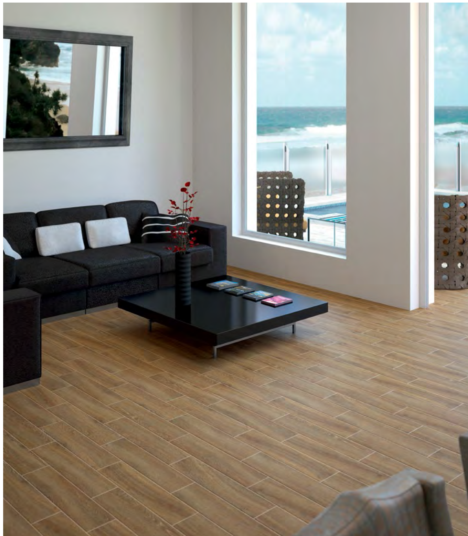
≡ Pavimento: Canaima Secuoya 15 x 60.